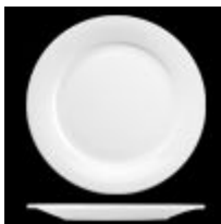
10 5/8 Mid Rim Plate ZCA PO11 10 5/8" 27.0cm