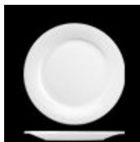
9 Mid Rim Plate ZCA PO9 9" 22.8cm