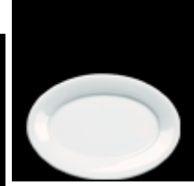
Oval Plate ZCA POV3 10 1/2" 25.4cm