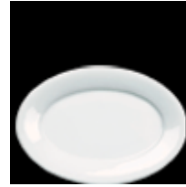
Oval Plate ZCA POV4 12" 30.5cm