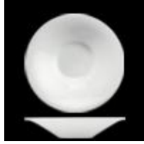
9 1/2 Broad Rim Starter Plate ZCA POSP 9 1/2" 24.1cm