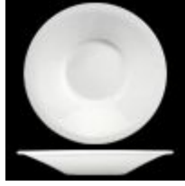
11 Broad Rim Dessert Plate ZCA PODP 11" 28.0cm