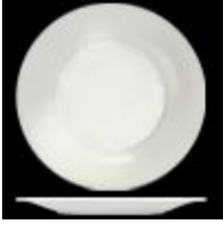
12 Broad Rim Dinner Plate ZCA PO12 12" 30.5cm